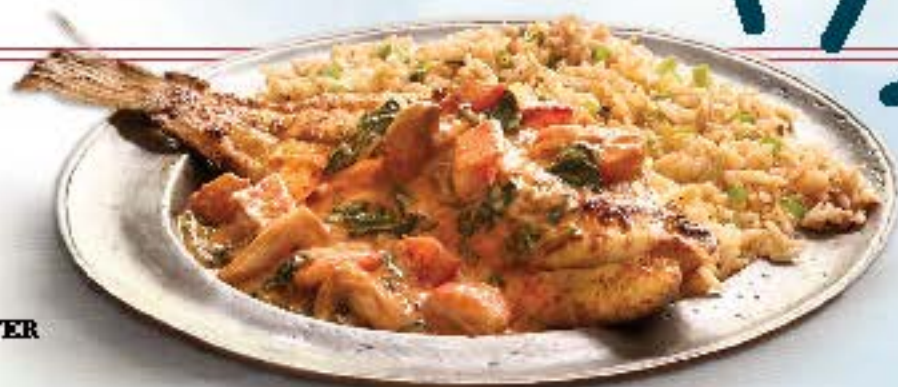
REDFISH 'N LOBSTER