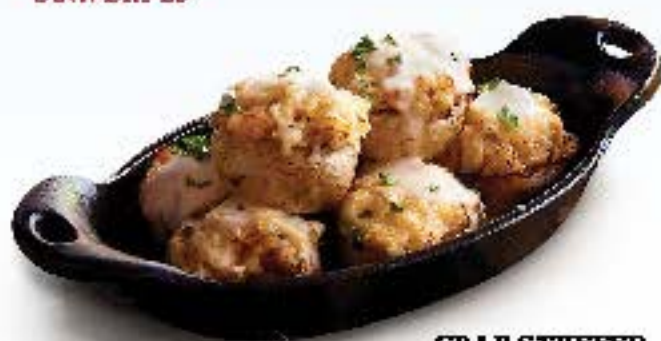
CRAB STUFFED MUSHROOM