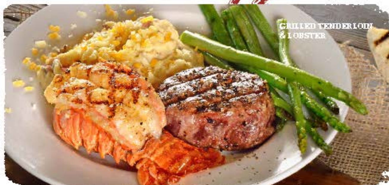
GRILLED TENDERLOIN & LOBSTER