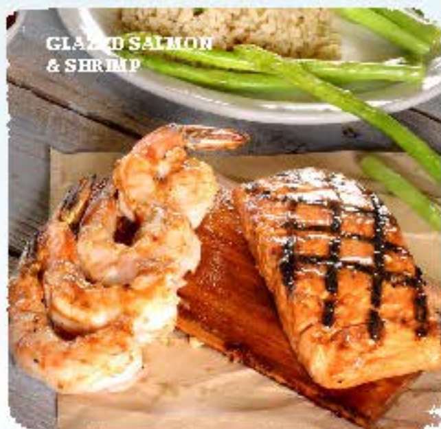
GLAZED SALMON & SHRIMP