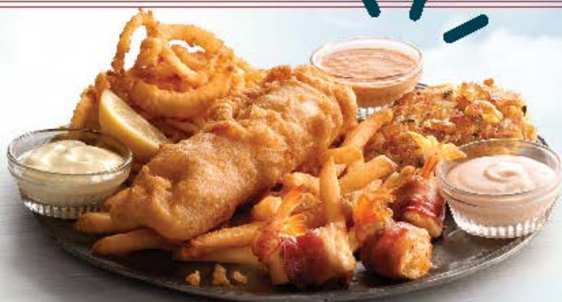
EAST COAST PLATTER