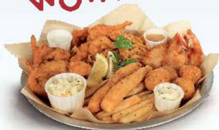
REEL BIG CATCH