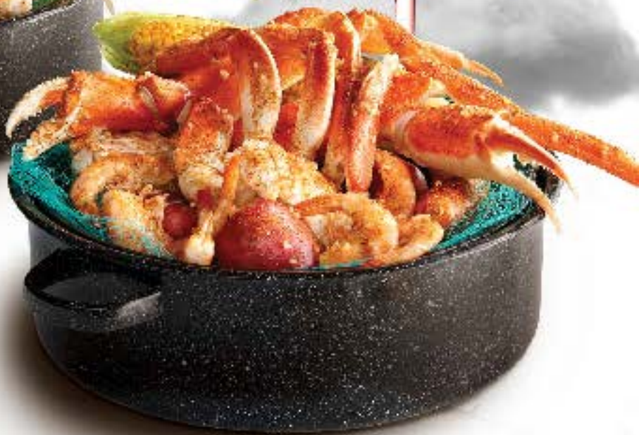
JOE'S CLASSIC STEAMPOT