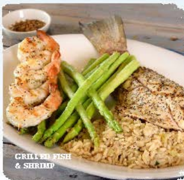
GRILLED FISH & SHRIMP