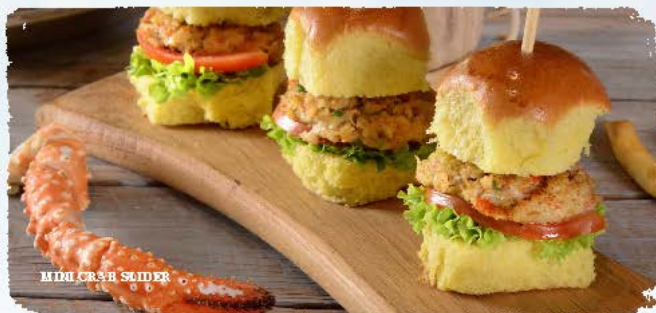
MINI CRAB SLIDER