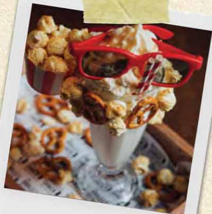
3D Caramel Popcorn Milkshake